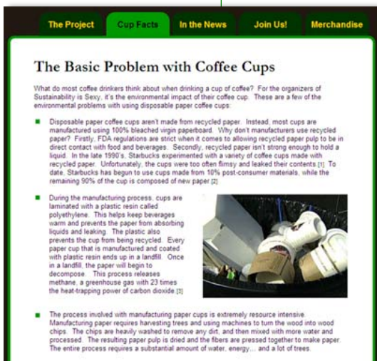
SIS Campaign Website

Our campaigns rely on communication tools that are effective with students, promote products that are alluring to young adults, and use language that resonates with your campus community.