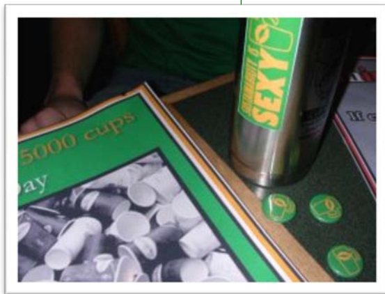
SIS Campaign Advertising Materials