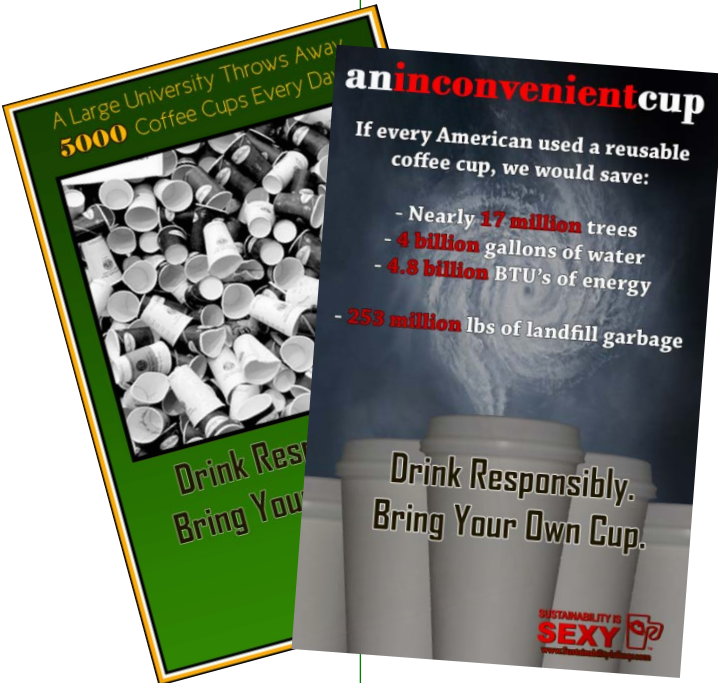
SIS Campaign Posters