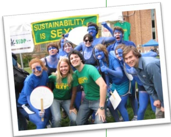
SIS Campaign Organizers